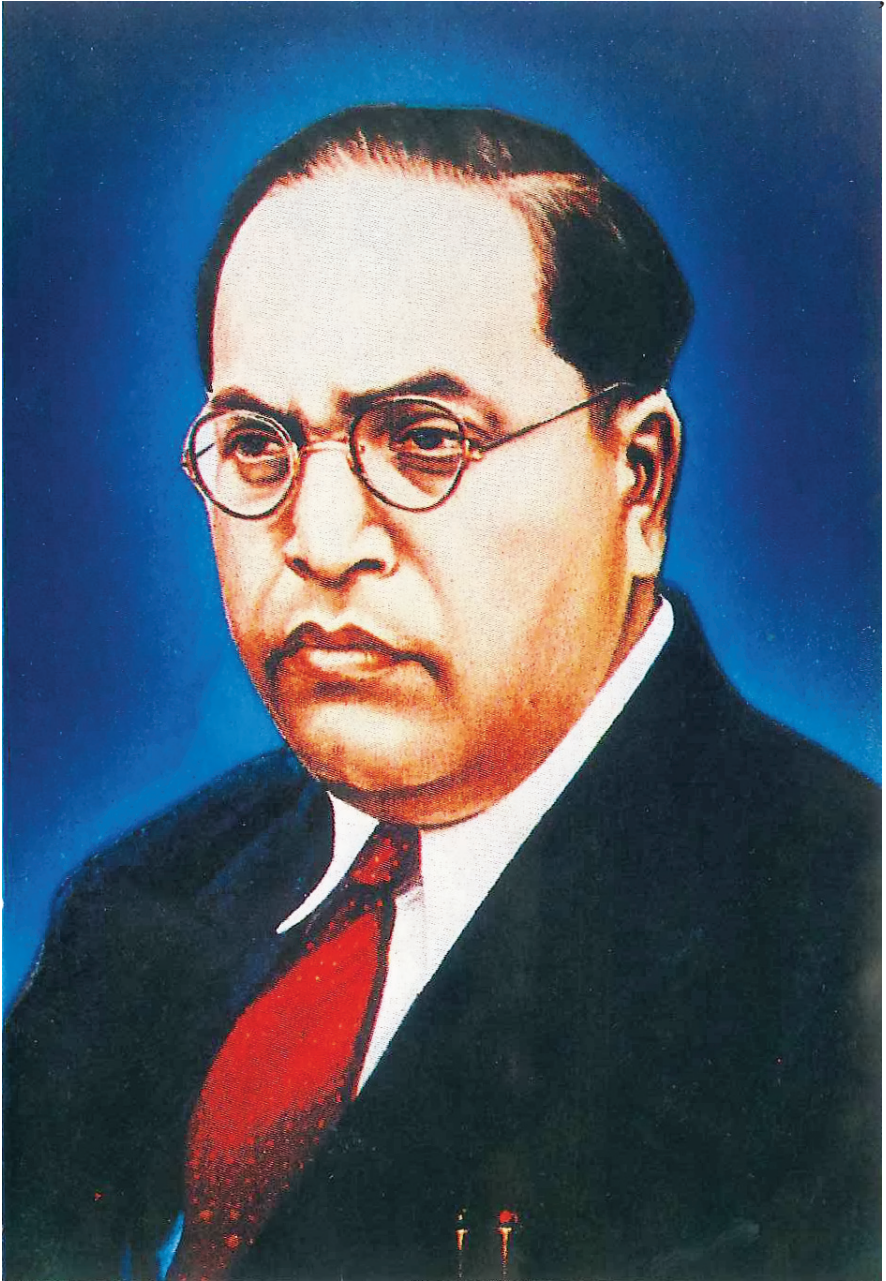
Babasaheb Dr. B.R. Ambedkar (14th April 1891 - 6th December 1956)