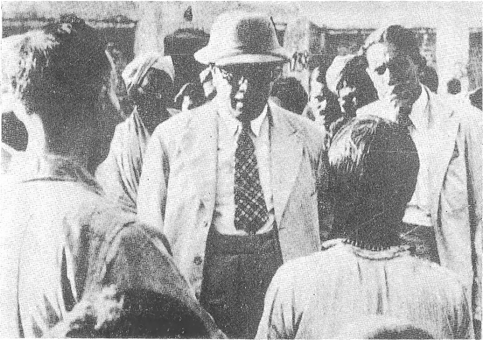
The Hon'ble Dr. B. R. Ambedkar talking to Colliery Labour during his tour of Coalmine areas on December 9, 1943.