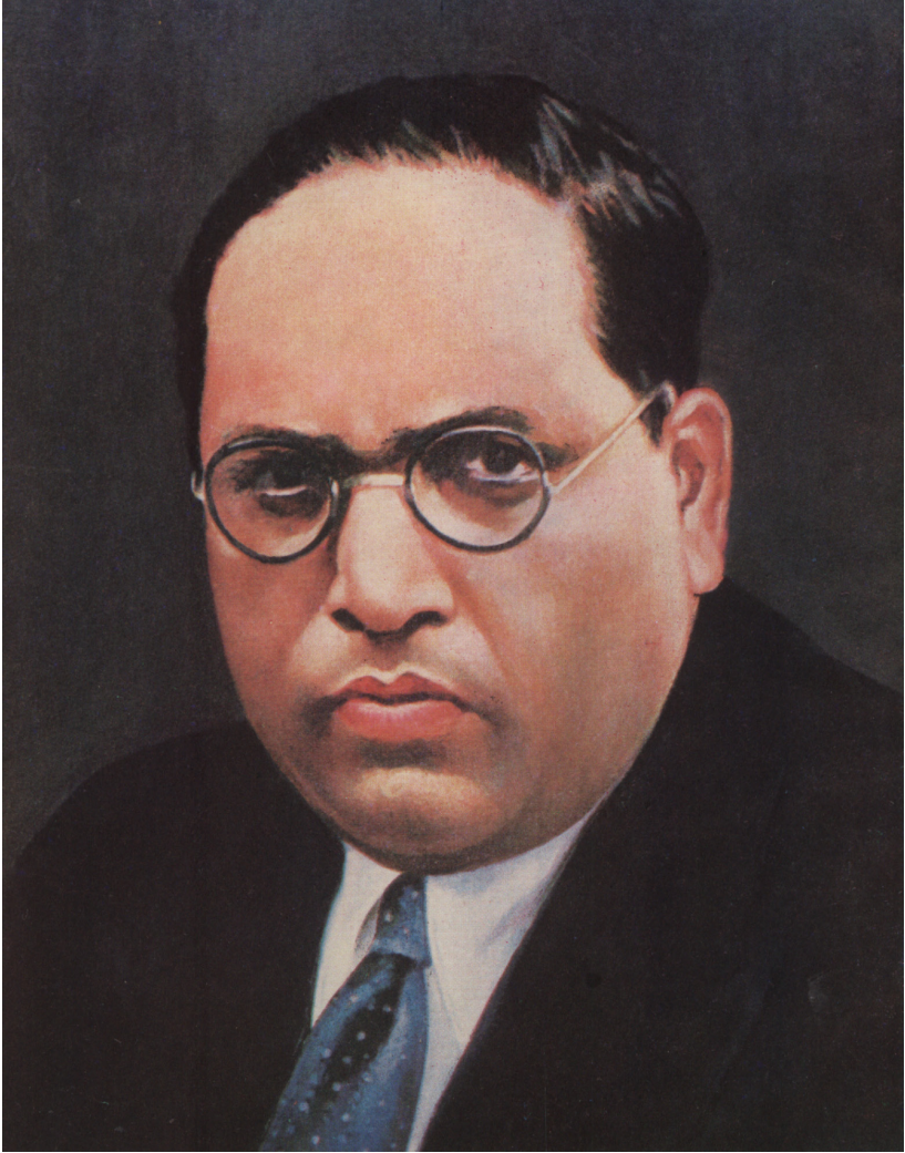
Babasaheb Dr. B.R. Ambedkar (14th April 1891 - 6th December 1956)