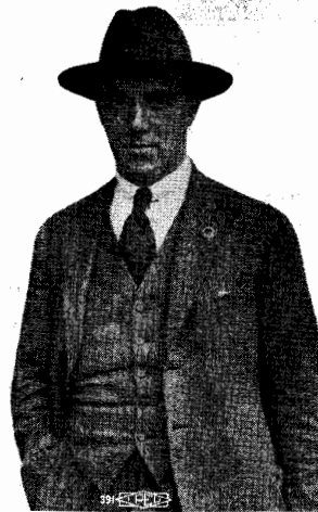
HARRY POLLITT OF THE BOILERMAKERS' UNION, NATIONAL SECRETARY OF BRITISH MINORITY MOVEMENT.

An important resolution was one condemning British imperialism and declaring solidarity with the working classes and labor unions throughout the British Empire. With the British workers, the question of imperialism, like that of trade union unity, is a closeup and burning one. The leaders of the Labor Party were scorched by several speakers for their imperialistic policy when in power. Now the conservatives controlling the government are declaring that Labor has no