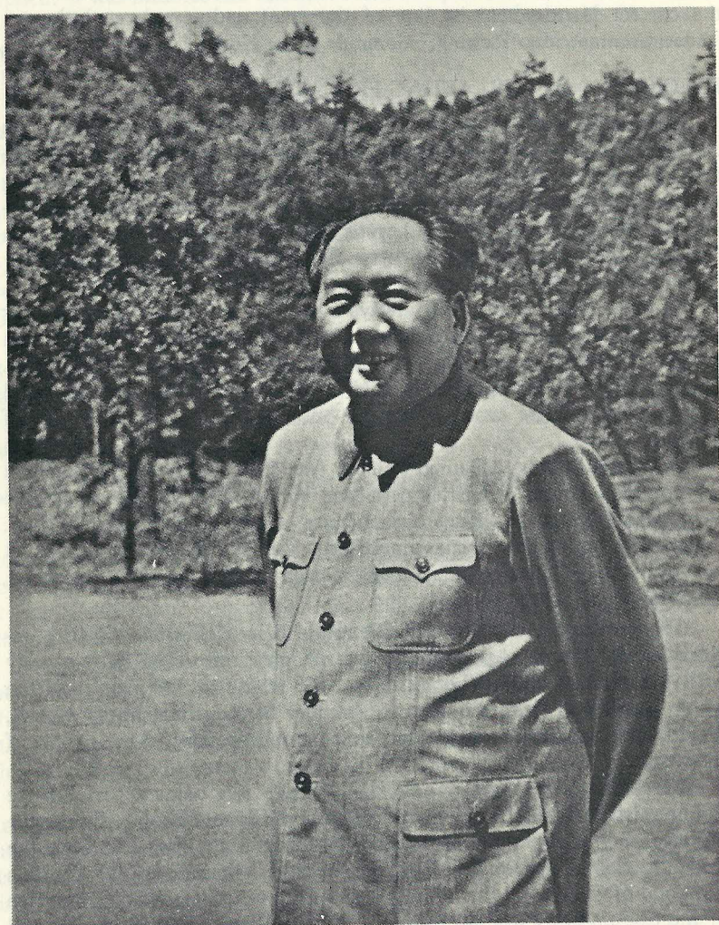
Chairman Mao at Ching Kangshan Mountains in 1965.

May the memory and work of Comrade Mao Tsetung, the glorious son of the Chinese people, the outstanding Marxist-Leninist, the most beloved and most respected friend of the Albanian people, live through the centuries.