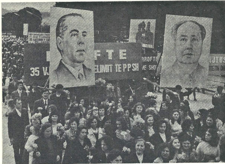
Albanian people demonstrate their ties of friendship with the Chinese people and their great respect for Chairman Mao in May 1st parade.