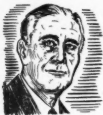
Franklin D. Roosevelt