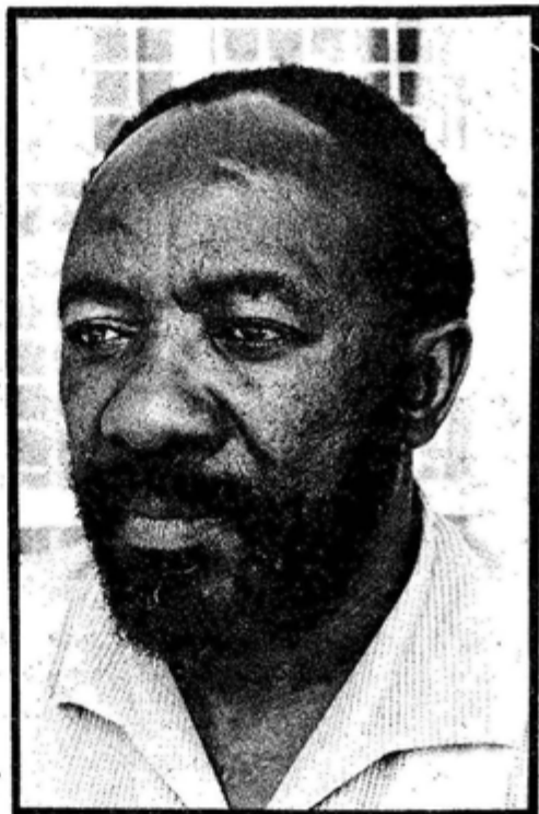
ALFRED NZO, ANC's Secretary General And National Executive Committee Member