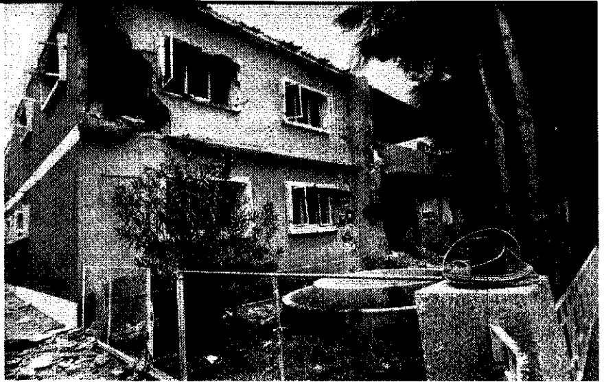
ANC residences outside Maputo shattered by South African raid January 1981.

Alarmed at the spread of MNR destruction, the Mozambican government last year initiated its own campaign to increase FRELIMO's presence throughout the country. Mozambican troops have been garrisoned in several towns in areas frequented by the MNR. And FRELIMO has placed new