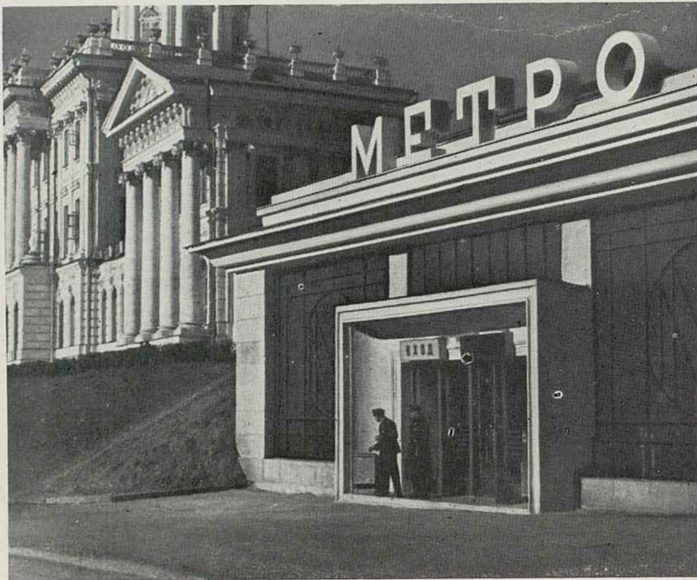
One of Moscow's new 'Metro' subway stations, with the Lenin Library in the background.