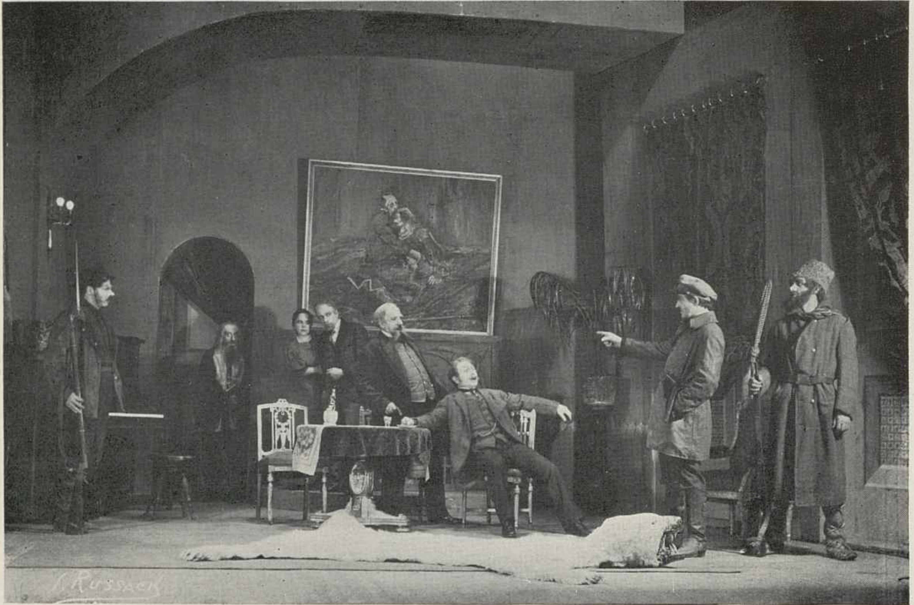
SCENE FROM "DOSTIGAYEV" BY MAXIM GORKY