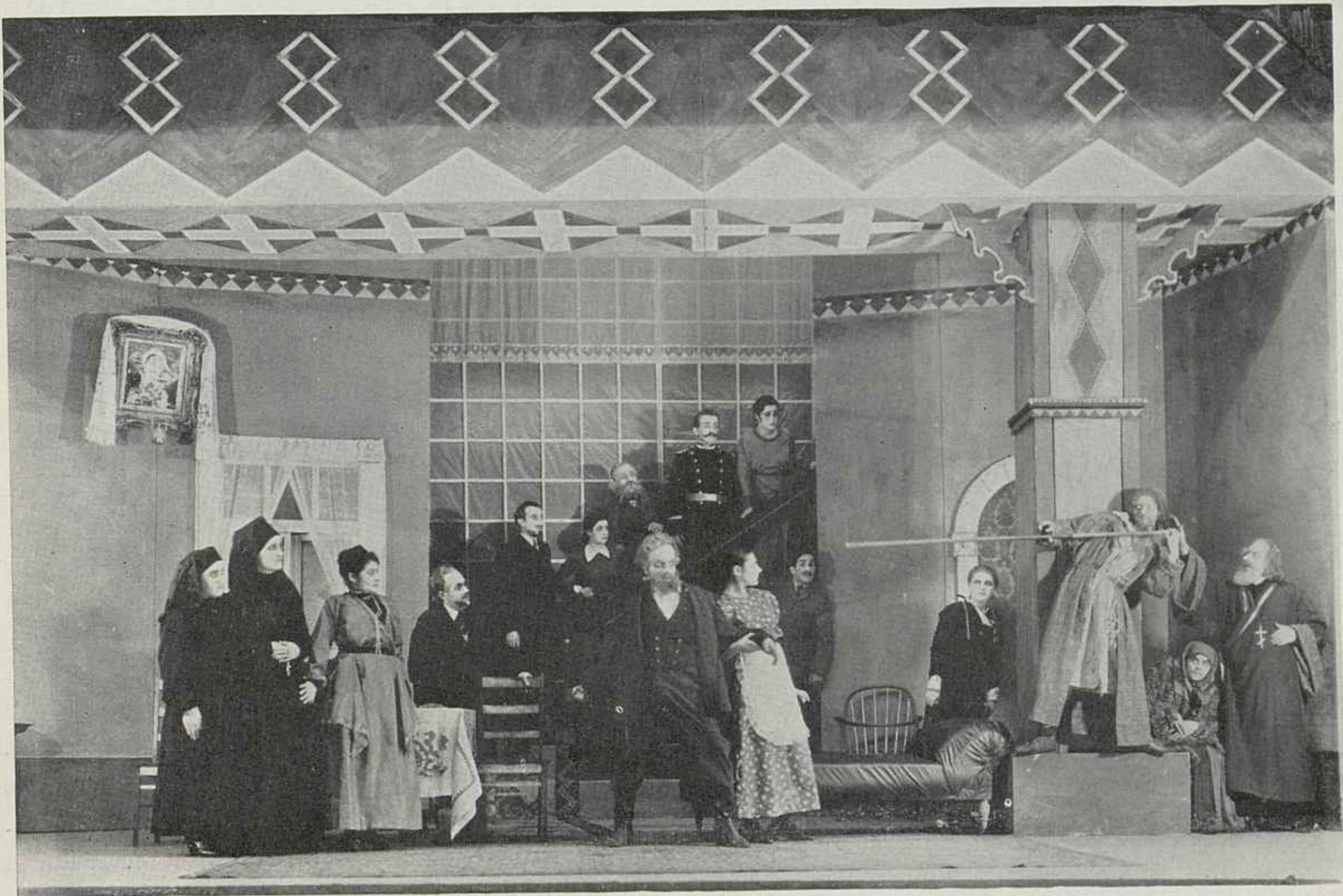
SCENE FROM "YEGOR BULICHEV" BY MAXIM GORKY

night after night for three seasons. And they presented themselves for a week-end of performances at the American Laboratory Theatre in the East Fifties with great trepidation. The result was electrifying. A homogeneous band of youthful performers had importantly come together to give quality and color to the drama in Yiddish, and the work of an extraordinarily inventive director was very much in evidence. But such a week-end of performances was all they could do, for they had no theatre of their own—no audiences they could rely upon for regular attendance—no funds for the making of production, and (apparently the most insoluble difficulty of them all), no real time to get plays ready with any frequency because of their daily jobs and the limitations of rehearsal and study to the evenings.