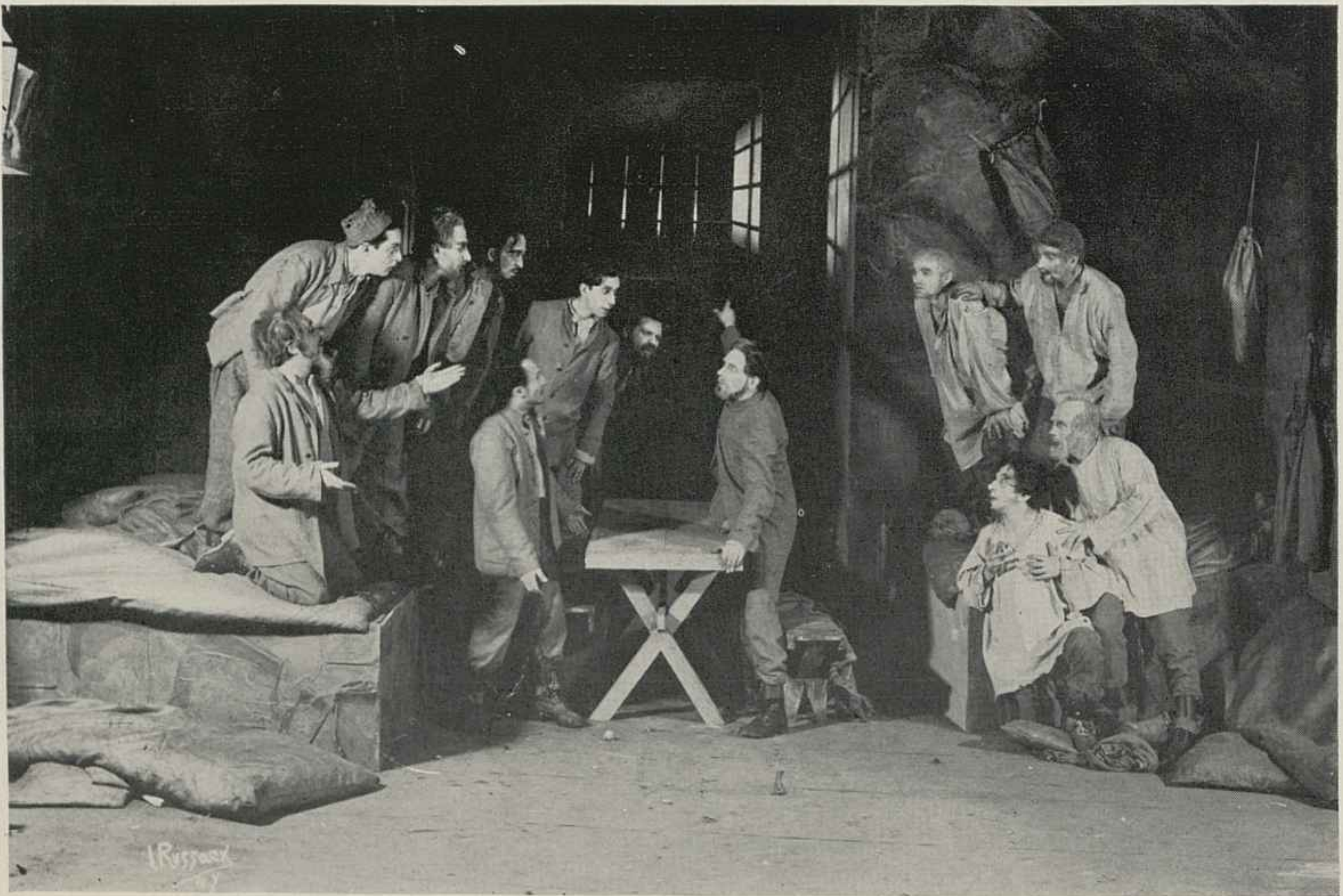
FIRST ACT OF "CHAINS" BY H. LEIVICK