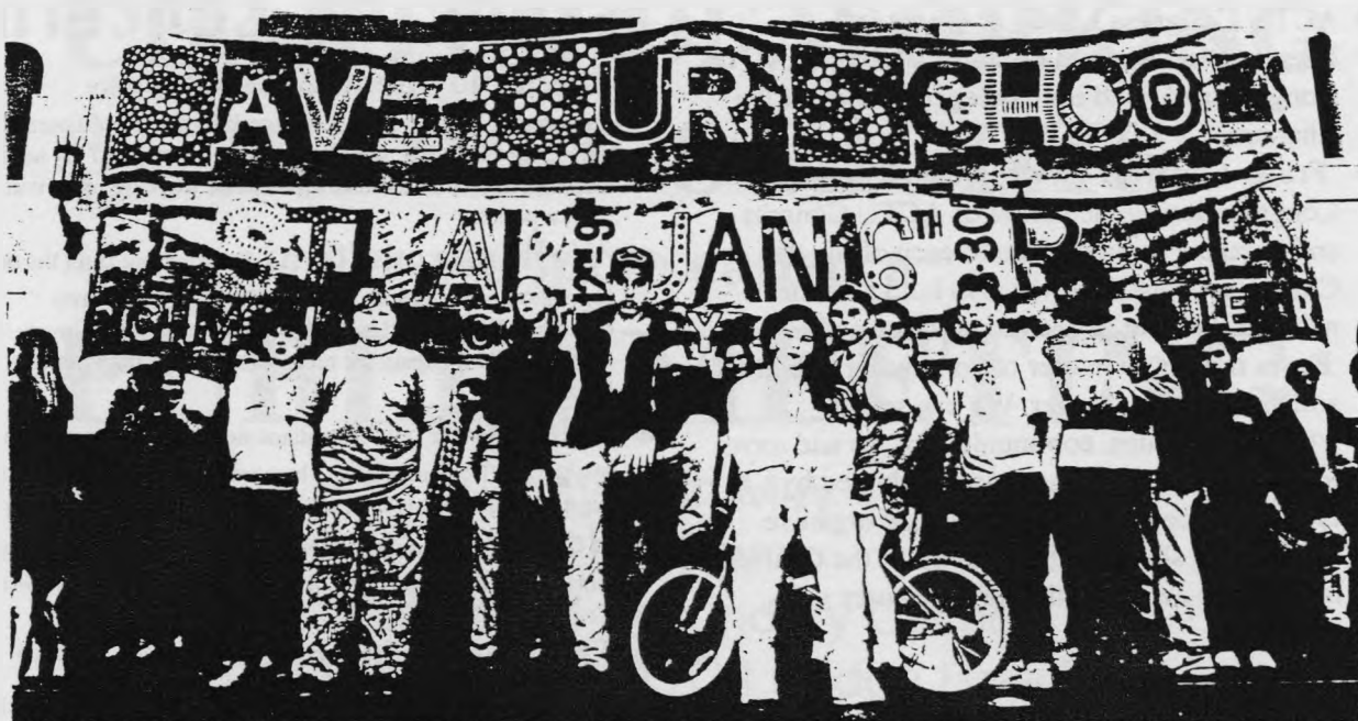
The occupation at Richmond Secondary College - heading for 150 days

This is a blatant handing over of state resources, which were once used to provide a quality education to the children of this state, to speculators who have no interest in anything but in bleeding our society dry to make a quick buck for themselves.